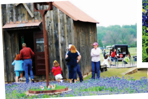
Shaw-Kemp Open House