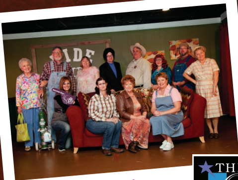
Theatre Off The Square