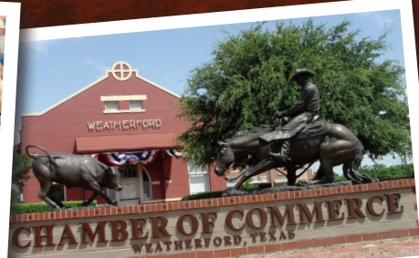
Cutting Horse Capital