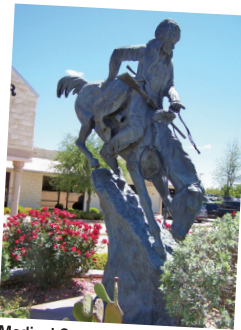
Medical Center @925 Santa Fe