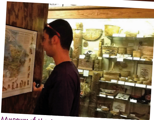
Museum of the Americas

The mission of The Doss Heritage and Culture Center is to collect, preserve & interpret the history of Parker County through cultural & educational events that raise community awareness & pride in our western heritage. Visitors are taken back to the early 1800's, when Charles Goodnight drove cattle through Parker County on the legendary trail named in his honor. In addition to rugged pioneers, Weatherford has been home to celebrity artists and actors. The Heritage & Culture Center brings Parker County history to life through exhibits of clothings, tools, furnishings, art and writings. Educational programs and exhibits focus on a wide range of history. www.dosscenter.org