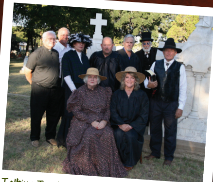
Talking Tombstone Tour

The Shaw-Kemp Open House happens only once a year in April. The Kemp family and a host of special volunteers wait to show visitors a little bit of history. A Texas historical marker, granted in 1982, shows the history of the Shaw-Kemp log cabin built in 1856 and restored in 1980. Other Shaw-Kemp ranch buildings include: Mt. Nebo School, church, grocery store, post office, barber shop and bath house, DeBeauford-Kemp house, sheriff's office, Combs log cabin and Kemp's Nebo Valley bank. A host of events will take place throughout the afternoon. Bluebonnets galore! FREE!