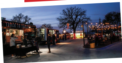
Food Truck Park

notable artists to the Heritage Park amphitheater. Local theater groups will be featured for both small & large productions.