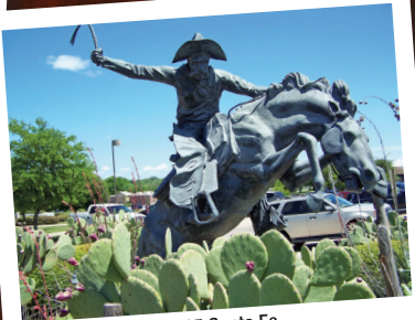
Brilliant Medical @925 Santa Fe