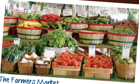
The Farmers Market

When it comes to shopping, Weatherford has many options! Historic downtown is a wonderful district to shop to your heart's content. There is no longer a reason to travel to the metroplex. From antiques to boutiques from specialty shops to department stores, Weatherford is the place to fill your shopping needs.