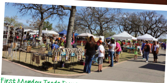
First Monday Trade Days

Parker County Peach Festival takes place on the historic Weatherford square the second Saturday of July. Dozens of vendors supply Peach ice cream, juleps, crepes, pies, or just sweet, juicy peaches are in abundance. More than 35,000 visitors enjoy shopping for arts, crafts, clothing, musical instruments, and food at more than 200 vendor booths. Live music floats through the air, youthful dancers perform, babies compete in the diaper derby, and cyclists race in the peach Pedal. Coming to the official Peach Capital of Texas is a slice of Americana you won't want to miss.