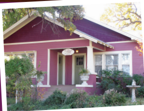
Rose Garden Cottage