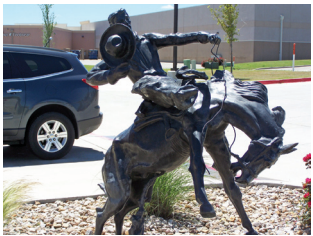
The Dermatology Spot @ 1841 Martin Dr.