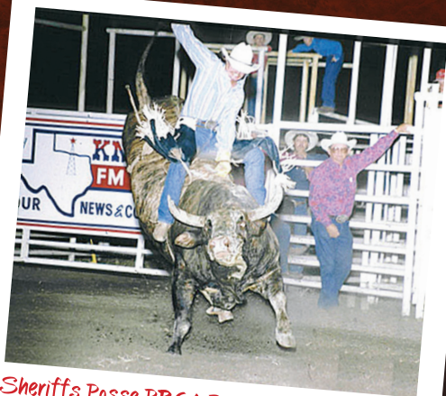
Sheriff's Posse PRCA Rodeo