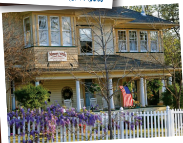
Places to Stay