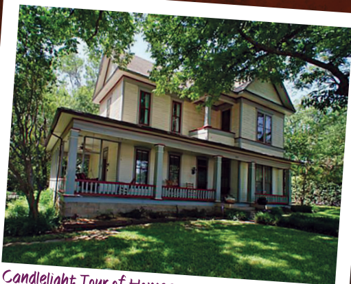
Candlelight Tour of Homes

Christmas on the Square rings in the holiday season on the first Saturday of each December. It's a time to begin shopping while enjoying seasonal music, food, and delightfully festive atmosphere. Many shopkeepers offer special bargains to help you complete your gift list.