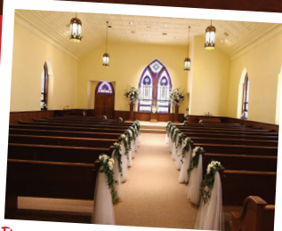
Brownstone Wedding Chapel

- In this 1894 stone structure, Brownstone Wedding Chapel has elaborate stained glass windows, wooden pews to seat 125 people with elaborate floral pew markers and a dramatic staircase. Windows, set deeply in stone walls, are decorated with wrought-iron candelabra. The altar is in front of a massively large stained glass window. Upstairs is the women's dressing area with the men located on the ground floor. An on-site reception hall is also available. The place to make your wedding affordable!