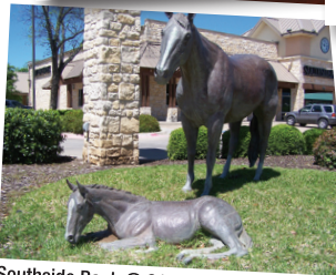
Southside Bank @ 318 S. Main