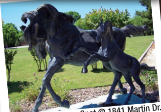
The Dermatology Spot @ 1841 Martin Dr.