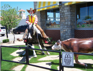
McDonald's @ 2407 S. Main