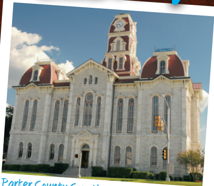
Parker County Courthouse