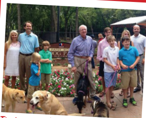
Patsy Hooks Dog Park

Heritage Park offers the community a safe environment for events that are within close proximity to downtown & centrally located to the community. Heritage Park spans 62 acres & is home to the Event Center, Patsy Hooks Dog Park & Food Park and hosts First Monday Trade Days on a monthly basis. The amphitheater will attract more tourism and position Weatherford as an entertainment hub outside the DFW area. It will seat 1500-2000 with additional space for handicap accessibility. In addition, the amphitheater will have state-of-the-art audio technology & opportunities for stage lighting during larger events. Summer concert series will bring local, regional &