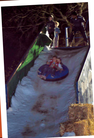
Holiday in the Park

Holiday in the Park is held at Heritage Park and features fun activities such as snow play areas, petting zoo, characters, holiday music, and food trucks. weatherfordtx.gov/holidayinthepark