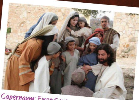
Capernaum: First Century Village

Weatherford Blooms is the newest festival in downtown. This blooming event focuses on Home & Gardens. Held typically in late March or early April, spring is in the air. The Weatherford Main Street hosts this fun event.