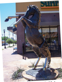
Sunny Street @ 1314 S. Main