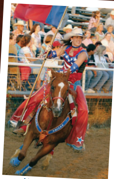
Sheriff's Posse PRCA Rodeo