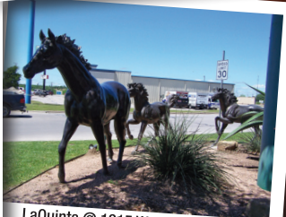
LaQuinta @ 1915 Wall Street